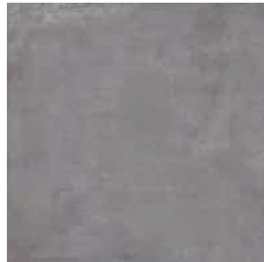
URBAN ANTHRACITE V2