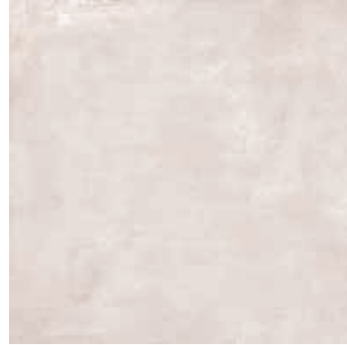
URBAN IVORY V2