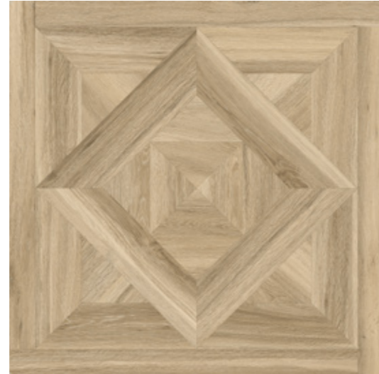
Ricordi Glam 01