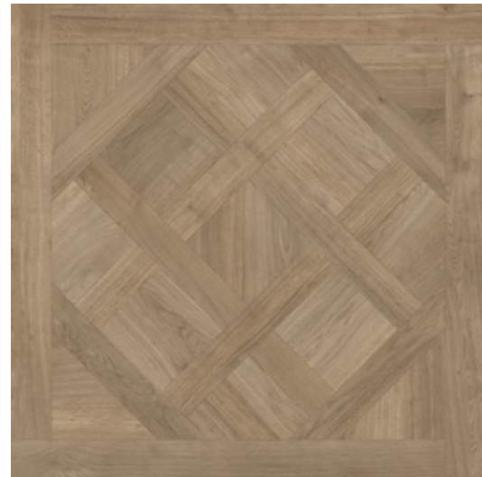
Ricordi Classic 02