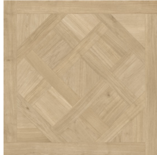
Ricordi Classic 01