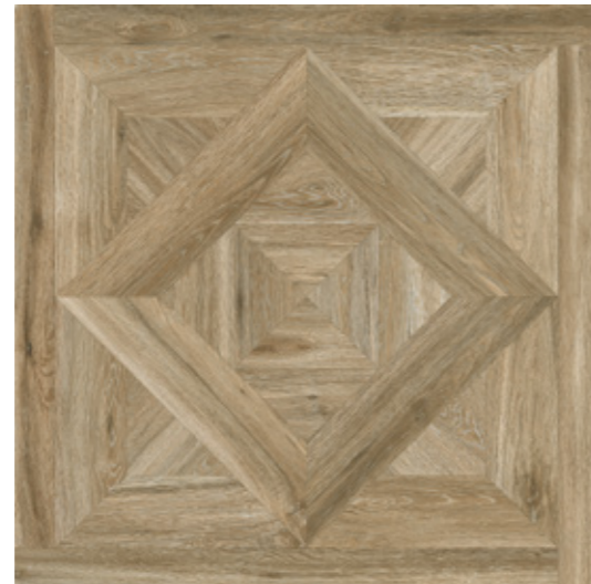
Ricordi Glam 02