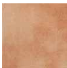
KK26QU Quarzo 26x26 - 10 \frac{1}{4} "x10 \frac{1}{4} "