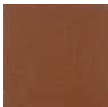
KK26MA Mattone 26x26 - 10 \frac{1}{4} "x10 \frac{1}{4} "